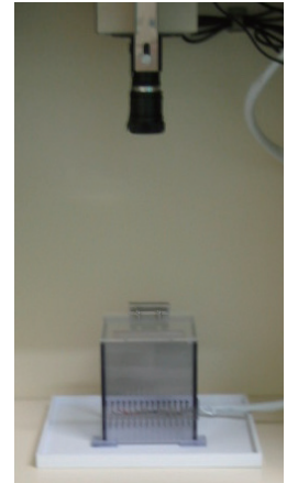
Image is captured from just above the test chamber