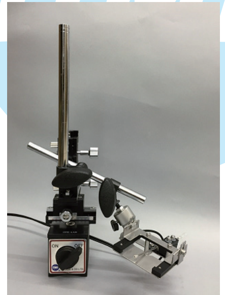
Licking sensor with XYZ manipulator

This is detecting sensor unit that subject animal licks spout. It uses infrared photo beam sensor. It is available to combine with our water supply unit.